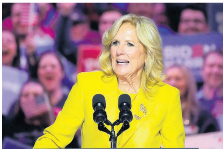
First lady Jill Biden speaks before President Joe Biden appears at an event on the campus of George Mason University in Manassas, Va., Tuesday, Jan. 23, 2024, to campaign for abortion rights, a top issue for Democrats in the upcoming presidential election.